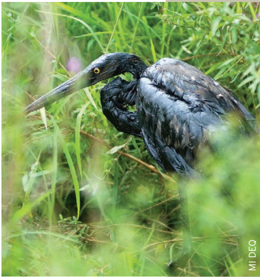
Great Blue Heron on the Kalamazoo River, covered in tar sands oil from the Enbridge spill.

pipes to the point that they are more susceptible to leaks and ruptures. Remarkably, there are no standards in place to ensure that new pipelines are built, maintained and operated with this fact in mind. As if these problems are not enough, when it spills, tar sands oil is much harder to clean up than conventional crude oil, most notably because it sinks in water, rather than floats, putting our streams and rivers at risk.